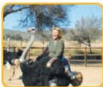
riding an ostrich