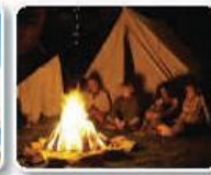
b. camping in the forest