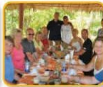
eating local food