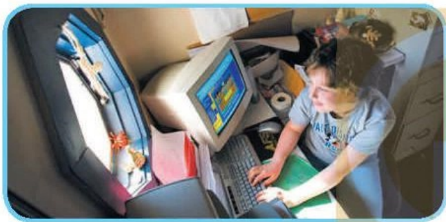
Digital English at school and at home