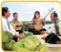
listening to traditional music

1 What do you know about the Mekong Delta? Work with a partner. Look at the pictures and decide which activities tourists can do there.