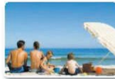
a. relaxing on the beach