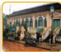
visiting an old house

2 Listen to a news report and choose the caption that best summarises the main idea.