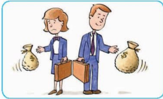
Same work – Same pay?